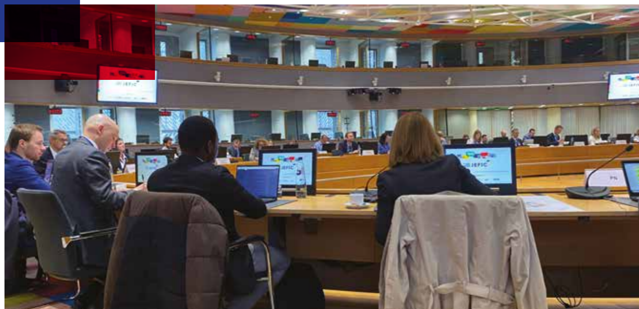
JEFIC participation in the CODEV meetings of the Council of the European Union @JEFIC

Through these areas of cooperation, JEFIC seeks to optimise complementarities among its members, reduce fragmentation, and contribute to more strategic, coordinated and impactful European engagement in partner countries.