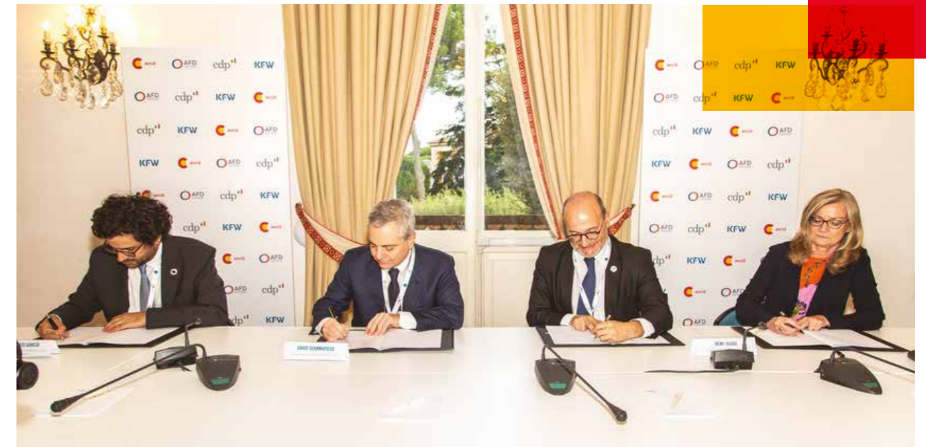
JEFIC Joint Declaration 2021

This approach has resulted in a significant share of JEFIC involvement in EU-backed operations, including EFSD+ blending and guarantee volumes, as documented in Chapter 2.