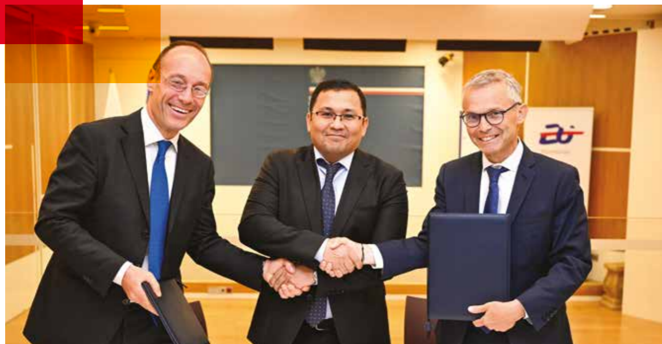
Signature of the Co-financing Agreement AFD-CDP on the Uzbekistan project

Building on existing complementarities, JEFIC strengthened its role as a collective platform for European bilateral public development banks , ensuring closer alignment also with Development Finance Institutions and multilateral partners in the delivery of EU external action priorities.