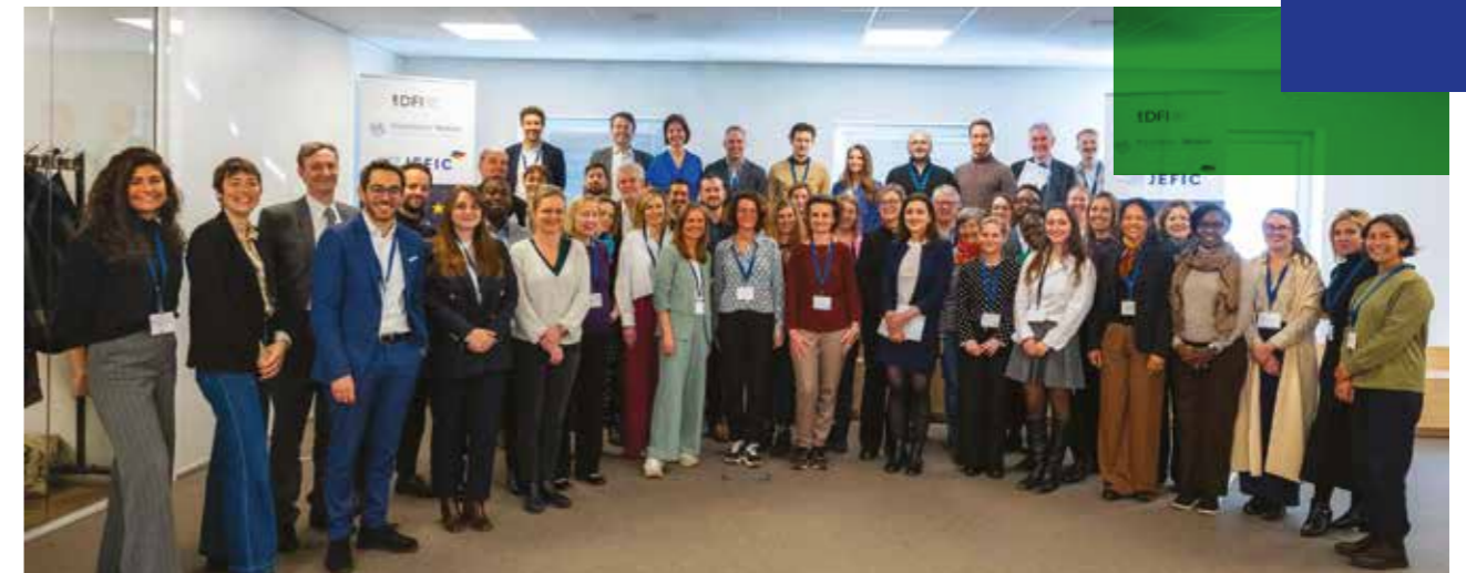
#TeamEurope Hackathon on Fragility @PN

A major step forward was the intensification of joint policy dialogue and advocacy , particularly in the context of discussions on the future Global Europe and the next MFF .