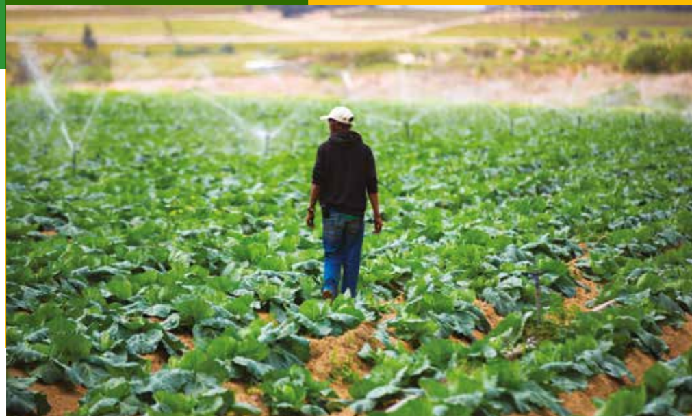
Modernisation of treatment plants project